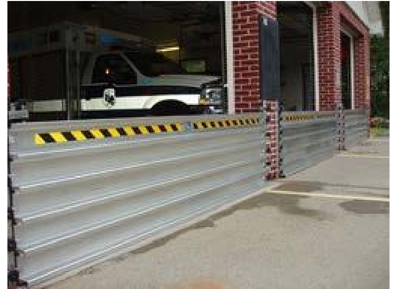
Closure Device (Opening Barrier), Certified Platinum Level