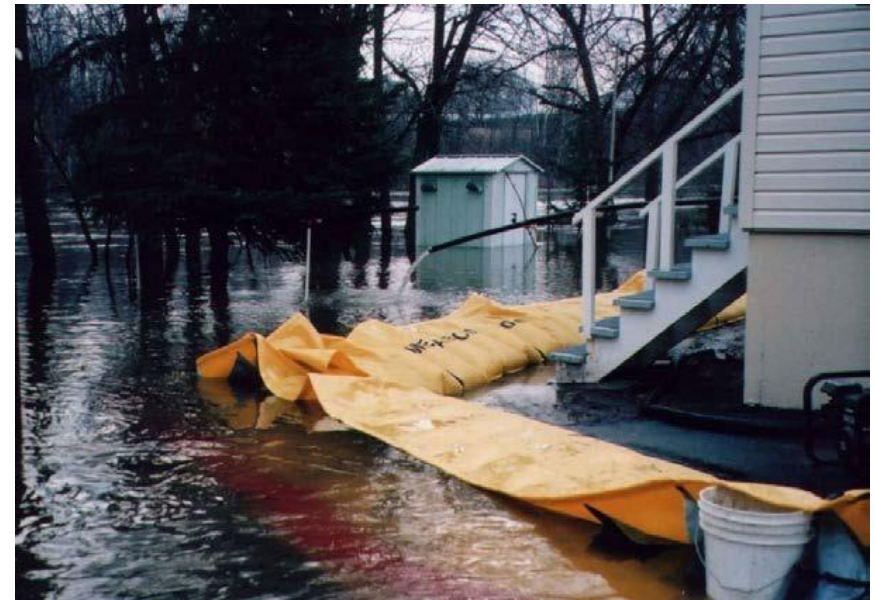
Temporary (Perimeter) Barrier, Certified Silver Level