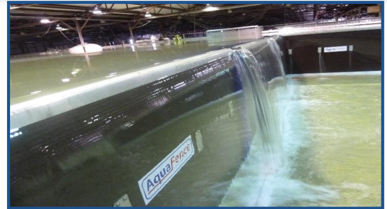
Overtopping test at ERDC. Water is brought to 1 inch above the barrier and allowed to overflow.