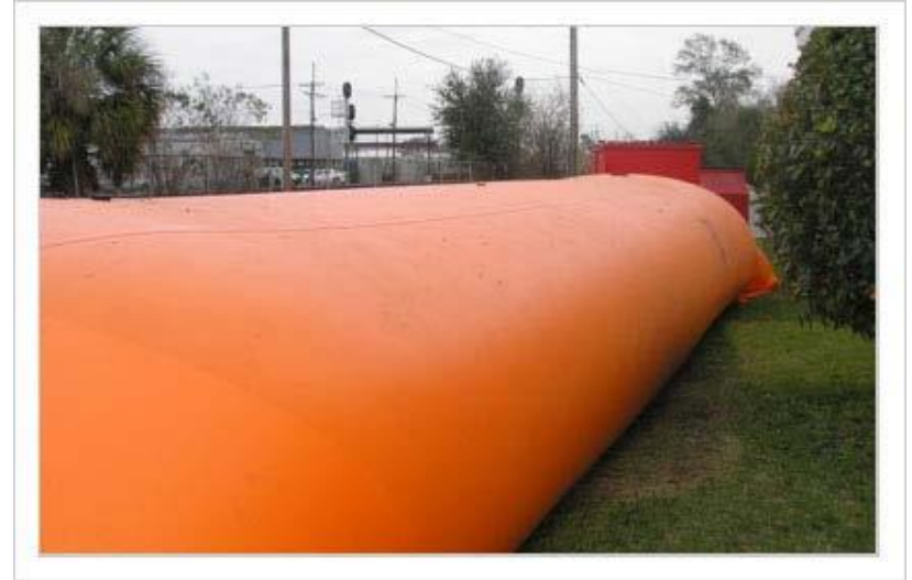
Temporary Barrier (Opening Barrier), Certified Platinum Level